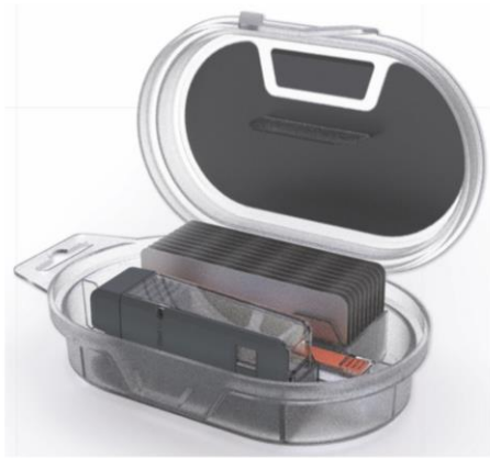
FlexiTester kit (assembled / open box)