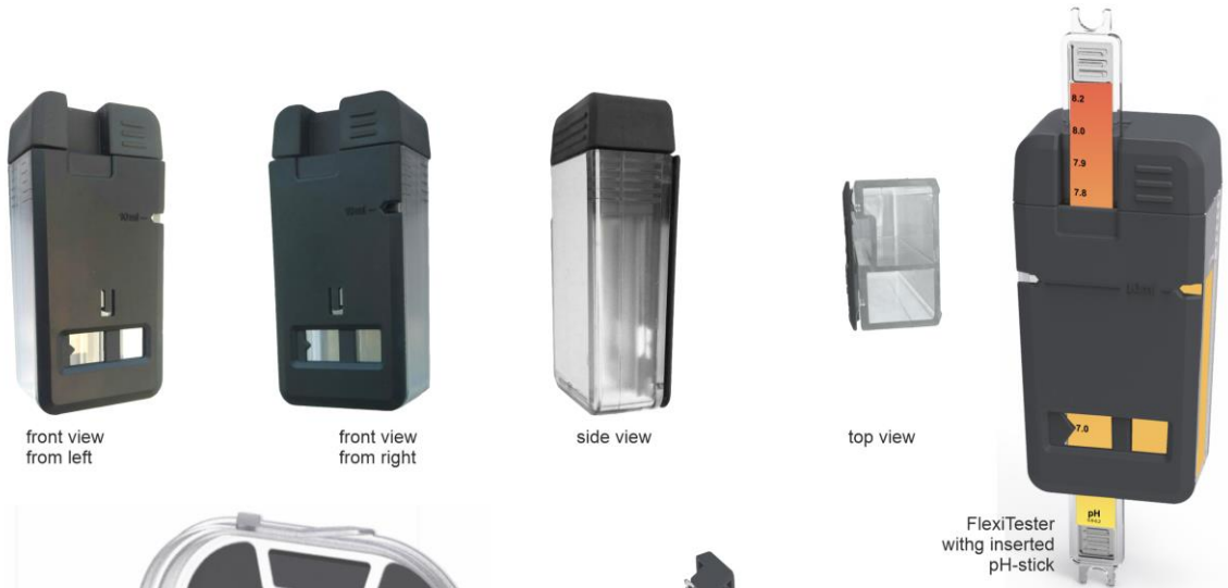
front view from left